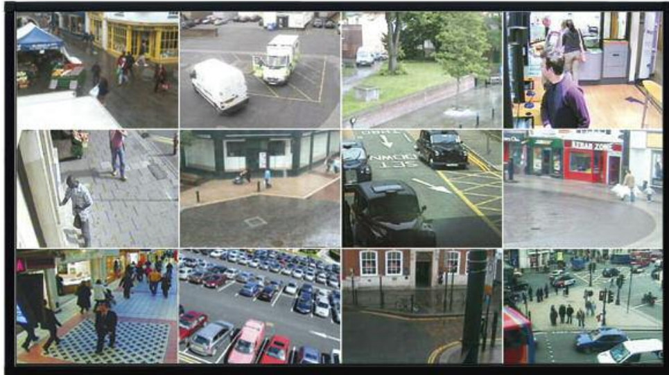
12 Images, correct aspect ratio