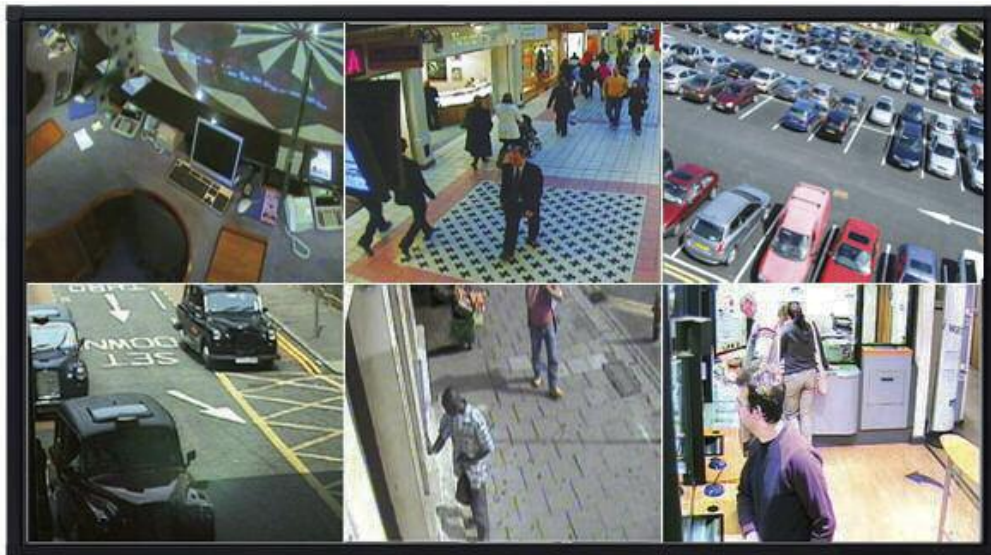
6 Images, Correct aspect ratio

Take 6, 9, or 12 existing video cables from your matrix (or from anywhere else) and connect them to the High Definition Display Controller . Connect a HDMI cable to the high definition (1920x1080) display. Switch the display on, and that's it. Any video switching setup on your existing control equipment / matrix will work as normal.